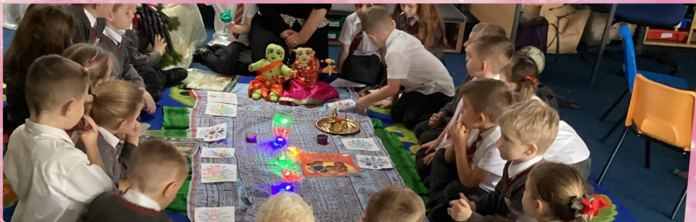
Other Faiths Week 2024 Year One Hinduism