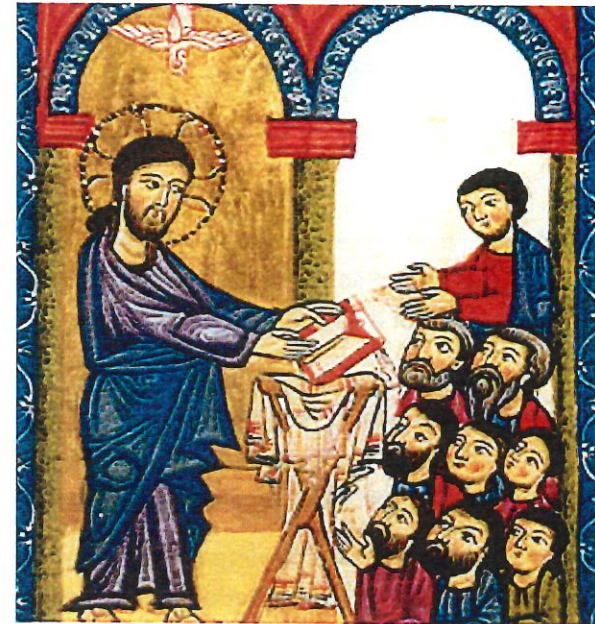
Jesus reading from the scroll of Isaiah in the synagogue "I have come to set the captives free".

"We find God in ourselves and we find ourselves in God" St Teresa of Avila.