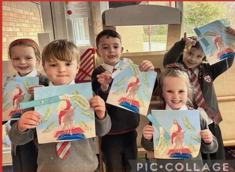
This week in DT, Year 1 have been looking at mechanisms and using levers to create a moving picture. The children linked it to Palm Sunday and created moving palm leaves showing Jesus entering Jerusalem on a donkey.