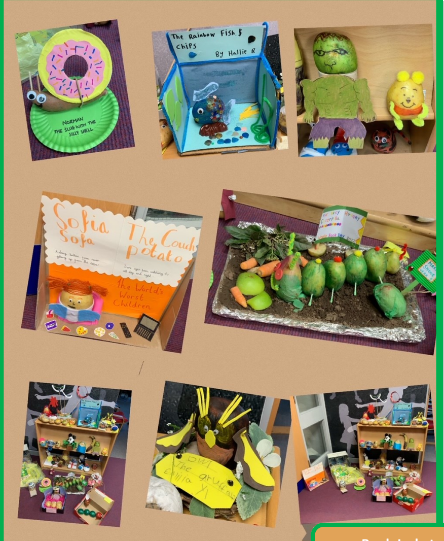
Book Jacket potato and Extreme Read Photo competition entries