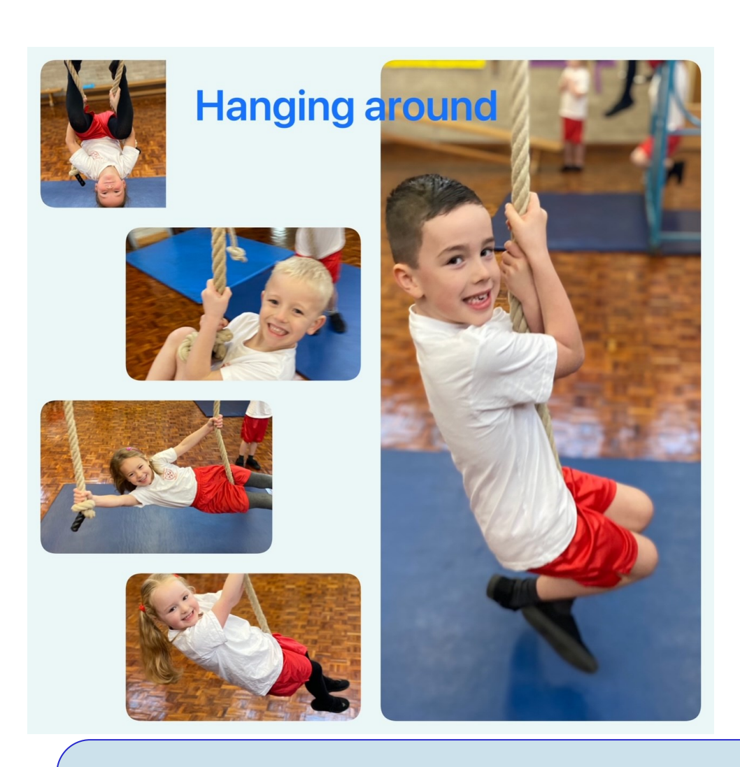
Year 1 Gymnastics.

The children have been working on travelling, balancing and landing safely this week in their PE lessons.