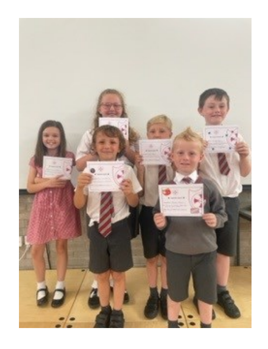
ECO WARRIOR AWARD